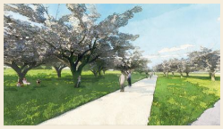
Cherry Tree Hill

The remains of a settlement that was evacuated after the earthquake, tsunami, and resulting nuclear power reactor accident.