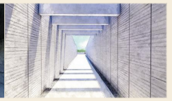
National Memorial Hall

The top of the memorial hall provides panoramic views, and signage indicates the direction of the earthquake's epicenter. Nestled inside the base of the hall is a