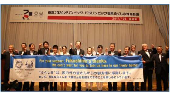
(At the end of the meeting, the Council unveiled a banner bearing a message of thanks to the world)