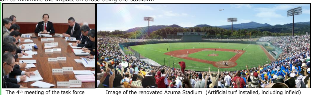
[Tokvo 2020 Official Program]

(Organised by: Tokyo 2020 Organising Committee, Tokyo Metropolitan Government with the support of Fukushima Prefecture, Koriyama City and others)