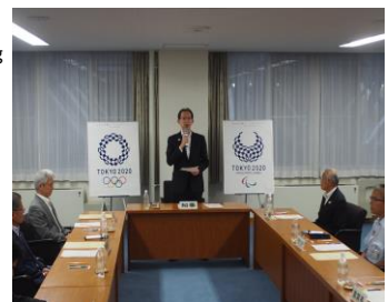
(Governor Uchibori at the 1st Executive Meeting

To be able to transmit the current situation of disaster-striken areas while valuing the balance of choice of locations within the prefecture to be worthy as the starting point for the Torch Relay as part of "Reconstruction Olympics".