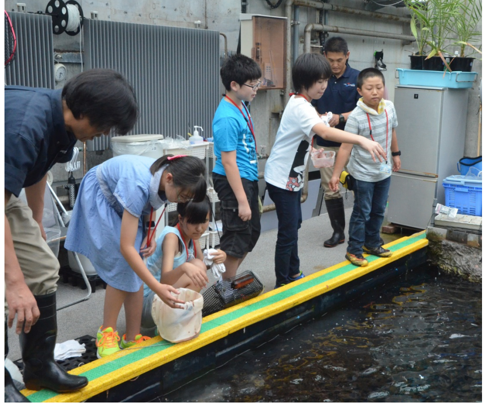
Members of our group feeding the fish at Aquamarine Fukushima

the fish. Every day, 30 to 40 kilos of feed is thrown into each of the fish tanks. The caretaker's other responsibilities include caring for the fish that have not been put on display and regular cleaning of the tanks. The caretakers do a great job introducing the splendors of the ocean around